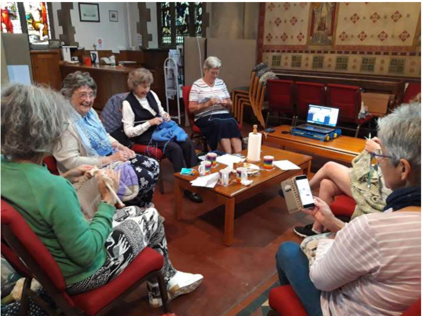
Knitting prayer shawls for Gaynor's Gifts