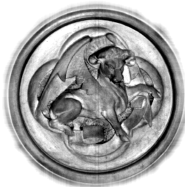
Winged bull of St. Luke - one of the badges on the pulpit