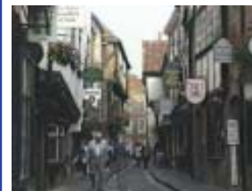
The Shambles, York