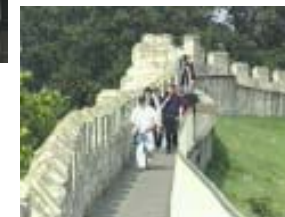
City Walls, York