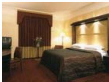
Double room in hotel