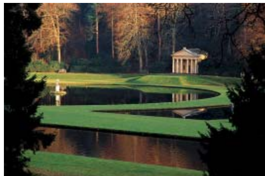
Studely Water Garden